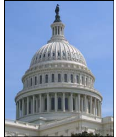
President-elect Obama will be sworn in on Jan. 20. Democrats will enjoy increased majorities in both the House of Representatives and Senate when the 111 th Congress convenes in January.